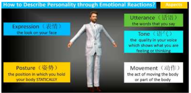
Fig.3: The PPT design of micro lecture: How to describe personality through emotional reactions